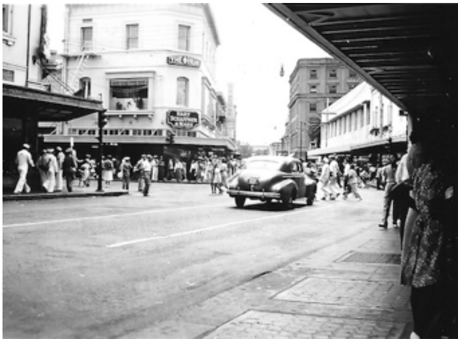
Pearl Harbor was a crossroads of the world during WWII. Civilians and sailors were coming and going everywhere all hours of the day and night. No one was certain of their future.